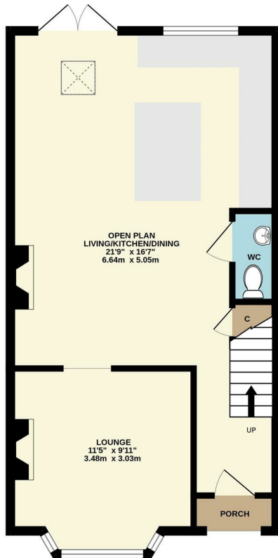
GROUND FLOOR 516 sq.ft. (47.9 sq.m.) approx.